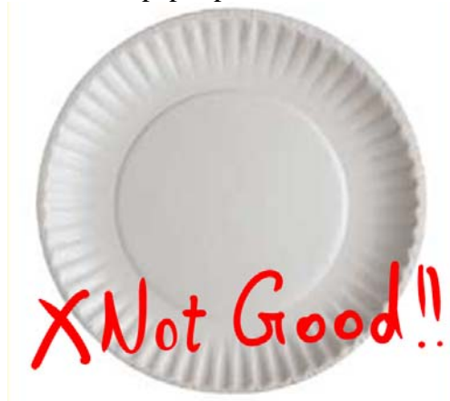
Figure 1: Thin plate

Get some paper plates. Some paper plates are too thin to be used for practice pads: