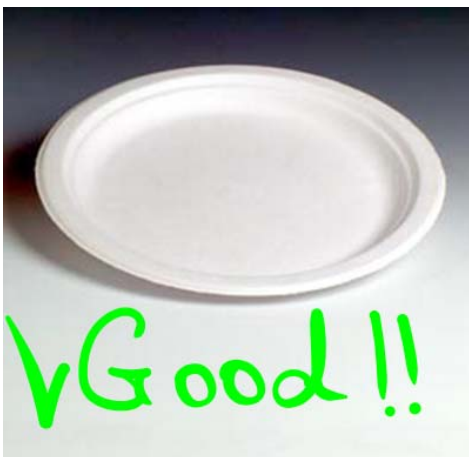
Figure 2: Thick Plate

I used 8 plates. You may use as many as you feel like it . . .