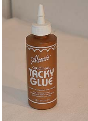
Figure 3: Tacky Glue